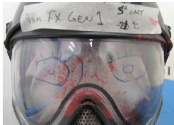
Figure 3: 9mm FX® test on nose