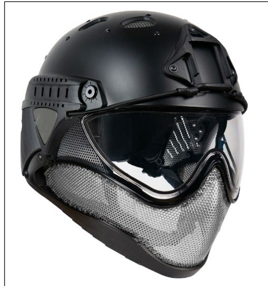
Figure 1: WARQ PRO® Helmet